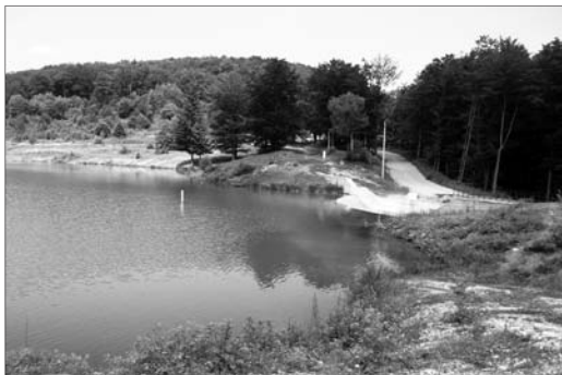
Figure 3. Accumulation “Seliste” on mountain Goc, (photo by Lazarević, 2012.)