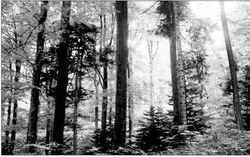
Figure 1. Beech and fir forests in the river Zagrže basin, management unit “Goč-Selište”

basin, there is a domination of eco-biological conditions of the forest type Abieto-Fagetum with its all sub-associations. Beech and beech-fir forests are plant communities with the greatest impact on the connection between rainfall and water running from the basin.